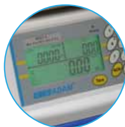
Back Lit LCD Displays